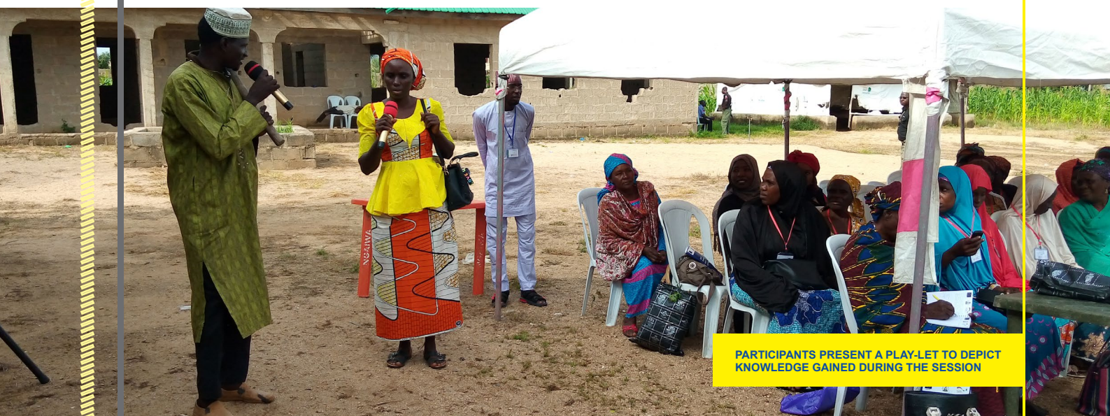
PARTICIPANTS PRESENT A PLAY-LET TO DEPICT KNOWLEDGE GAINED DURING THE SESSION