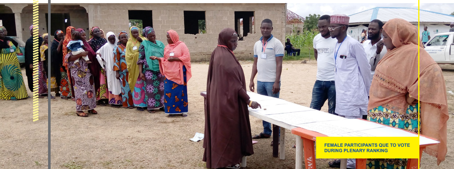
FEMALE PARTICIPANTS QUE TO VOTE DURING PLENARY RANKING