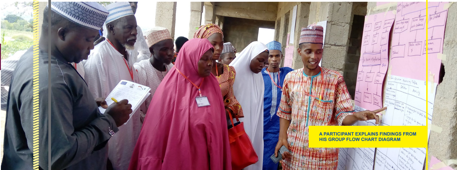
A PARTICIPANT EXPLAINS FINDINGS FROM HIS GROUP FLOW CHART DIAGRAM