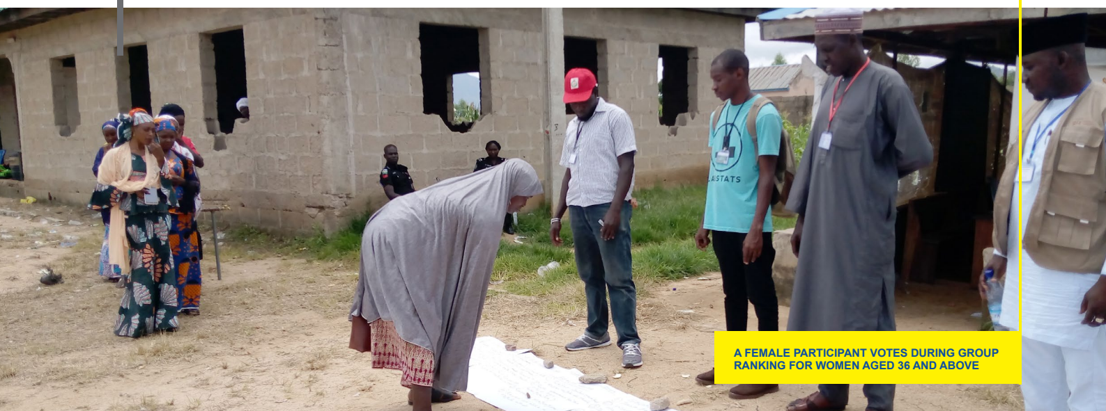
A FEMALE PARTICIPANT VOTES DURING GROUP RANKING FOR WOMEN AGED 36 AND ABOVE