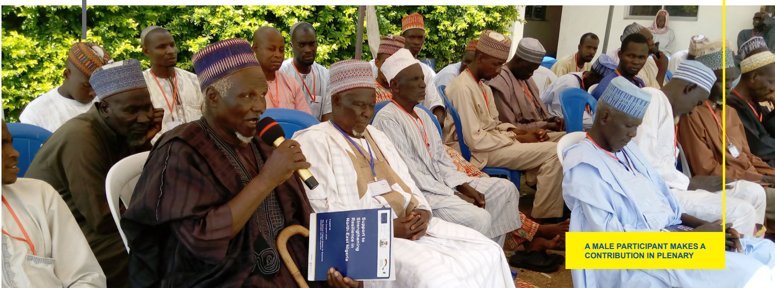
A MALE PARTICIPANT MAKES A CONTRIBUTION IN PLENARY