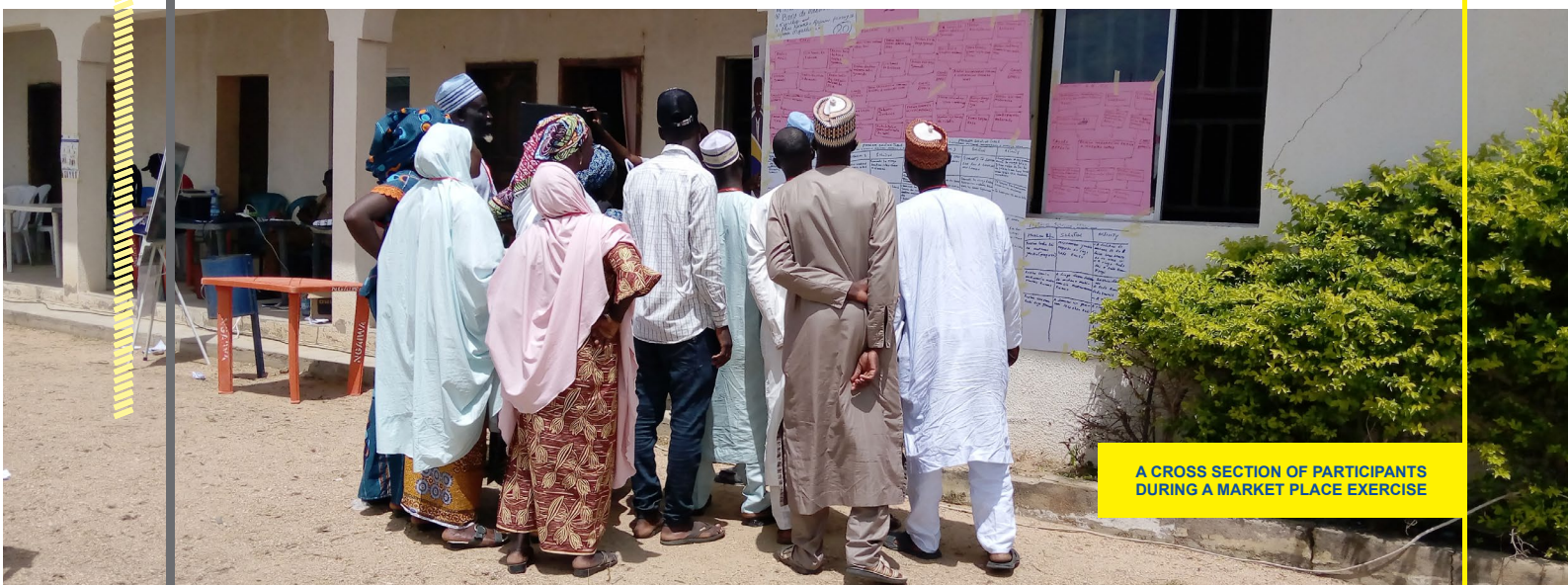
A CROSS SECTION OF PARTICIPANTS DURING A MARKET PLACE EXERCISE