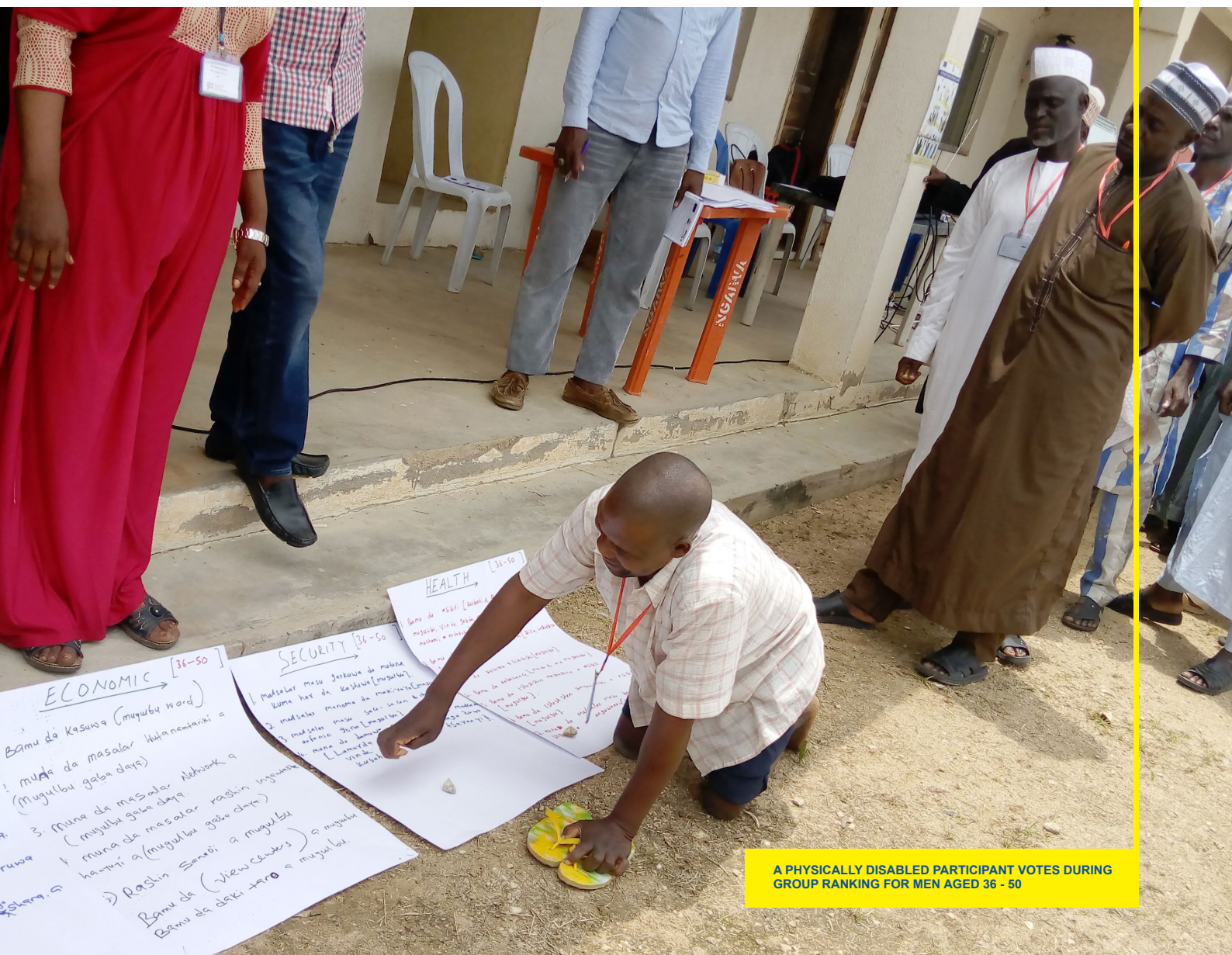
A PHYSICALLY DISABLED PARTICIPANT VOTES DURING GROUP RANKING FOR MEN AGED 36 - 50