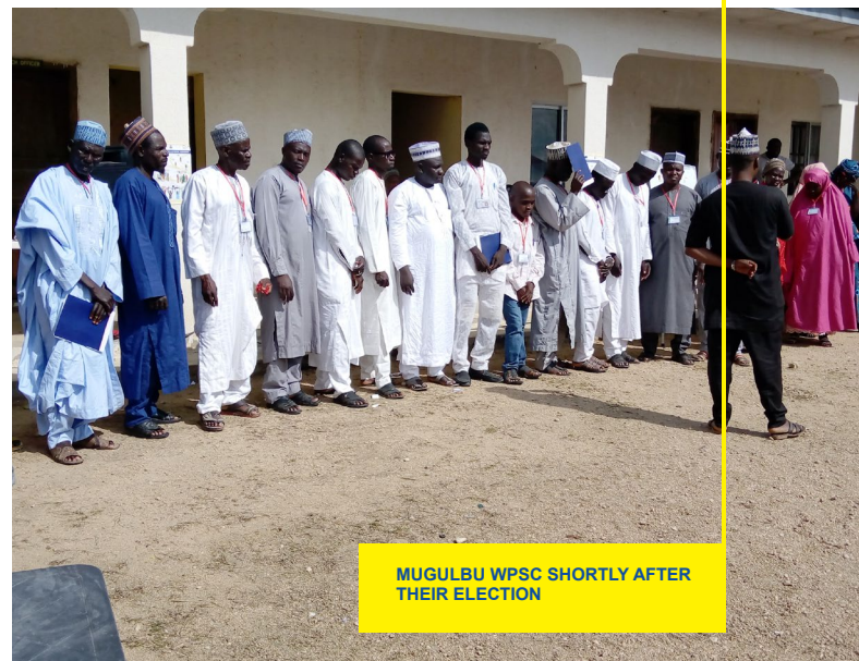
MUGULBU WPSC SHORTLY AFTER THEIR ELECTION