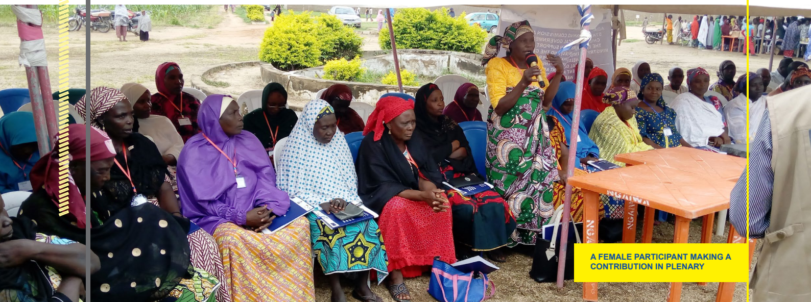
A FEMALE PARTICIPANT MAKING A CONTRIBUTION IN PLENARY

I urged the present and future generation to hold on to our cherished values of love unity and hard work, to take formal education seriously as an enduring legacy, to be law-abiding and to be responsible citizens. My profound gratitude to the European Union, the German Federal Ministry for Economic Cooperation and Development for taking an interest and providing resources to educate my people on sustainable development; GIZ for organizing the process and CPPLI the partnering Civil Society Organization (CSO) for facilitating the sessions. We welcome any organization or agency with the mandate to help our people particularly the less privileged and vulnerable in the community