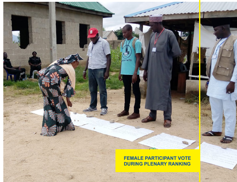
FEMALE PARTICIPANT VOTE DURING PLENARY RANKING