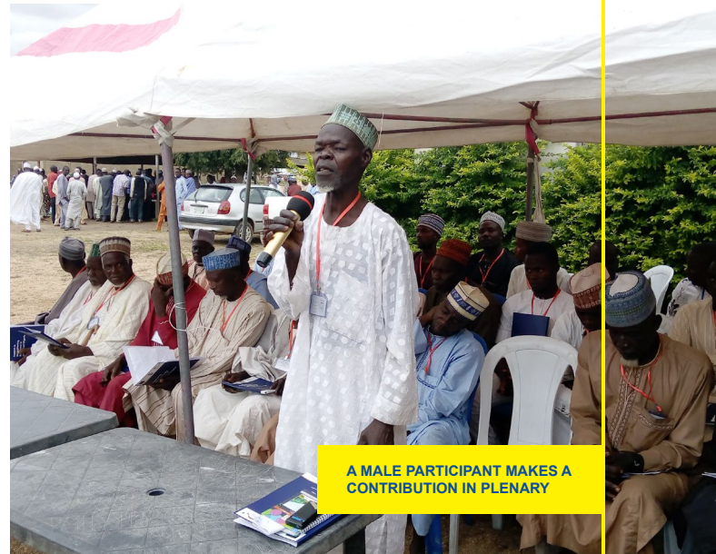
A MALE PARTICIPANT MAKES A CONTRIBUTION IN PLENARY

The tangible results of the Mugulbu ward CDP process and especially the CDP session is this Ward Development Plan. This Plan and its content were validated by the representatives of the Mugulbu ward.