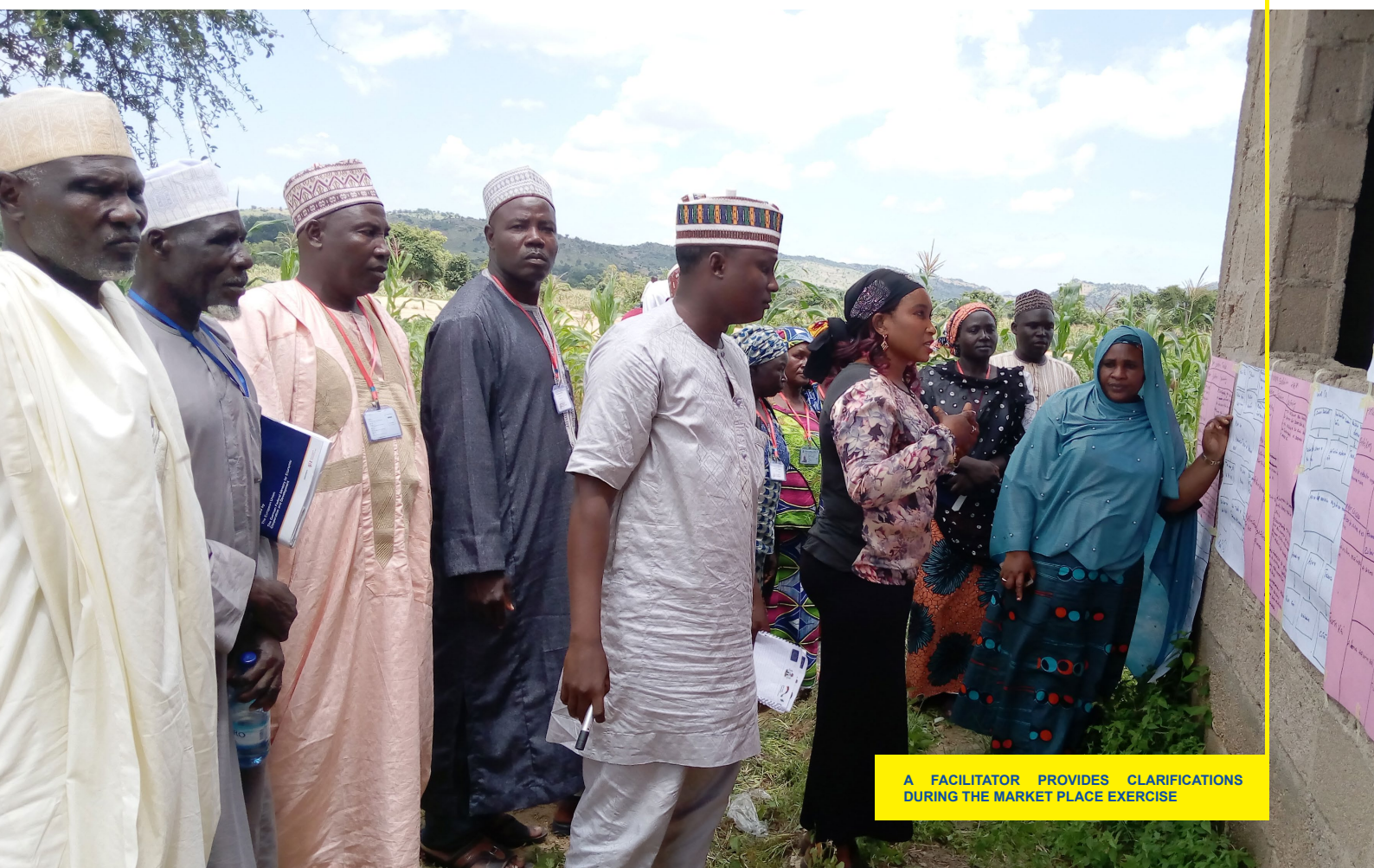
A FACILITATOR PROVIDES CLARIFICATIONS DURING THE MARKET PLACE EXERCISE

In the tables below, you will find a summary of our discussions: